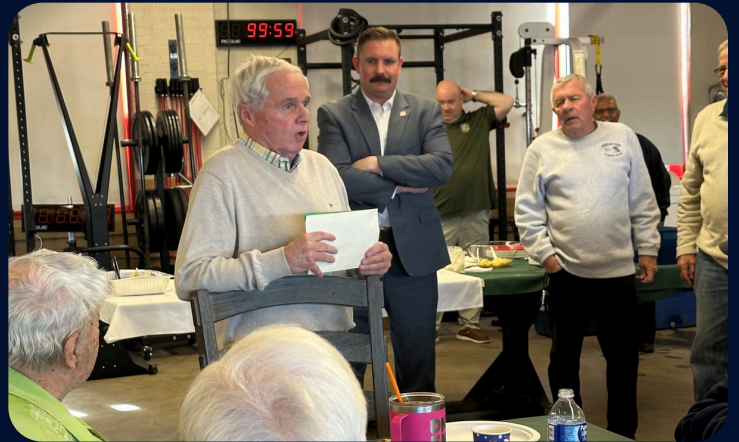
LIAR'S CLUB CHRISTMAS PARTY