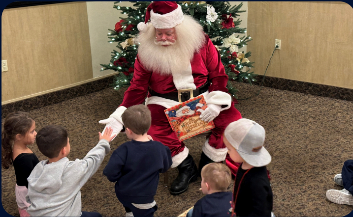
JUNIOR MEMBERS MEET SANTA